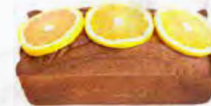
ORANGE BREAD LOAF