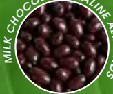
MILK CHOCOLATE PRAINE ALMONDS