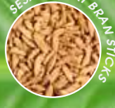
SESAME OAT BRAN STICKS