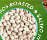
PISTACHIOS ROASTED & SALTED IN SHELL