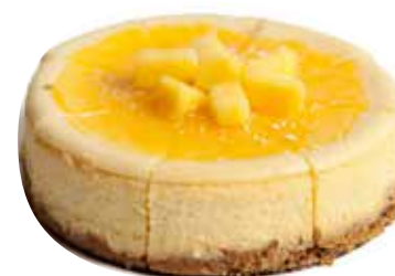
PINEAPPLE MANGO CHEESECAKE