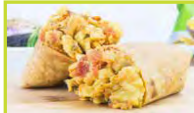
HASHBROWN, EGG & CHEESE WRAP WHEAT