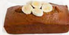
BANANA BREAD LOAF