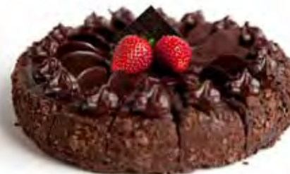
FUDGE DARK CHOCOLATE