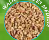
WALNUT PIECES MEDIUM