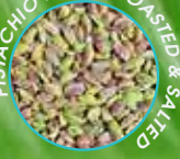
PISTACHIO MEATS ROASTED & SALTED