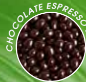
CHOCOLATE ESPRESSO BEANS