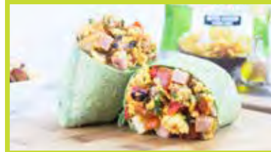
HAM, EGG, ROASTED POTATOES & CHEDDAR CHEESE WRAP