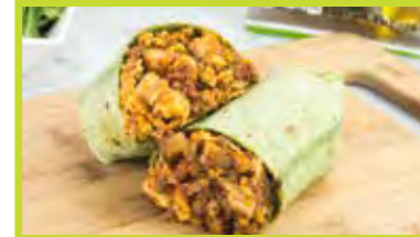
SOYRIZO, EGG & CHEESE WRAP