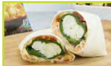
CHILE RELLENO WRAP