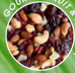
GOURMET FRUIT & NUT MIX