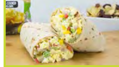
TURKEY BACON BREAKFAST WRAP