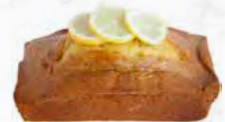
LEMON BREAD LOAF