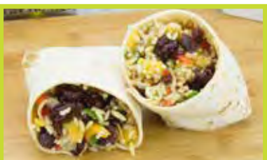
WILD RICE WITH CRANBERRY AND MANGO WRAP