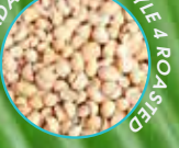
MACADAMIA NUTS STYLE 4 ROASTED