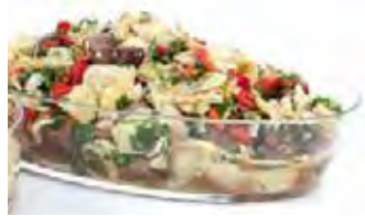
MUSHROOM & ARTICHOKE SALAD