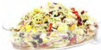
QUINOA & EDAMAME WITH FETA CHEESE