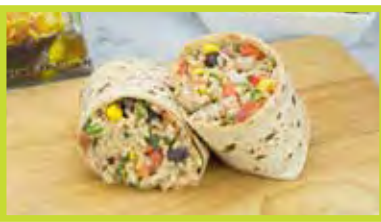
VEGETABLE & HUMMUS WRAP