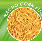
NACHO CORN STICKS