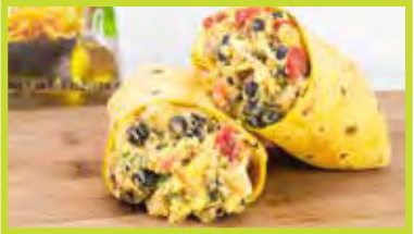
SOUTHWEST STYLE EGG, BLACK BEAN, CHEDDAR AND PEPPER JACK WRAP