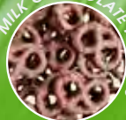
MILK CHOCOLATE PRETZELS