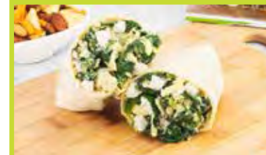
SPINACH, KALE & FETA CHEESE WRAP