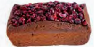
CRANBERRY BREAD LOAF