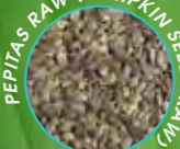
PEPITAS RAW (PUMPKIN SEEDS RAW)