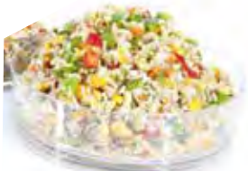
BROWN RICE WITH VEGETABLE SALAD