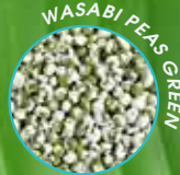
WASABI PEAS GREEN