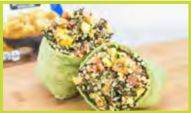
QUINOA, SALSA, EGG & ROASTED POTATO BREAKFAST WRAP