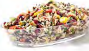
WILD RICE W/ CRANBERRIES & MANGO SALAD