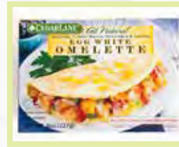
UNCURED TURKEY BACON, VEGETABLE & CHEESE OMELETTE GLUTEN FREE