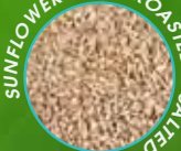
SUNFLOWER SEEDS ROASTED & SALTED