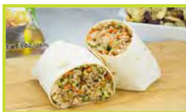
TERIYAKI CHICKEN WRAP