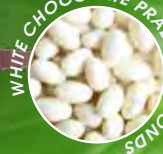
WHITE CHOCOLATE PRAINE ALMONDS