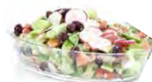
GREEK VEGETABLES WITH FETA