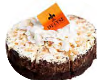
CHOCOLATE HAUPIA MOUSSE CAKE WITH TOASTED COCONUT