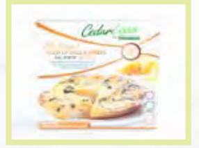
ROASTED CHILE & CHEESE EGG WHITE FRITTATA GLUTEN FREE