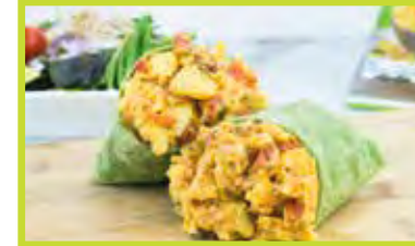
HASHBROWN, EGG & CHEESE WRAP FLOUR