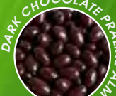
DARK CHOCOLATE PRAINE ALMONDS