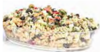
GREEK PASTA MEDLEY SALAD