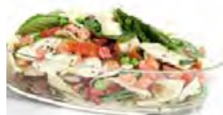
PESTO AGNOLOTTI SALAD