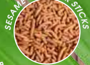
SESAME CHEDDAR STICKS