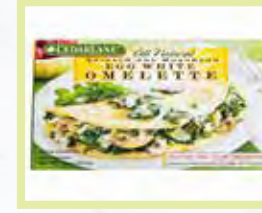
SPINACH AND MUSHROOM OMELETTE GLUTEN FREE