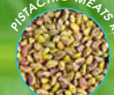
PISTACHIO MEATS RAW