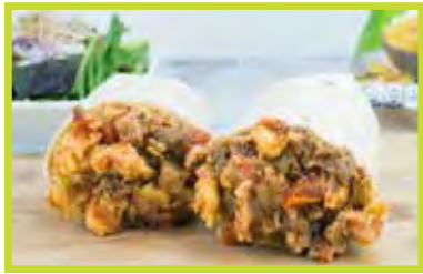
TURKEY SAUSAGE, SALSA, EGG & ROASTED POTATO BREAKFAST WRAP