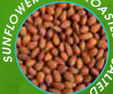
SUNFLOWER SEEDS ROASTED & SALTED