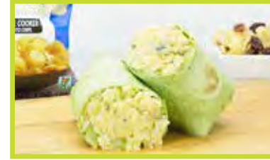
EGG SALAD WRAP