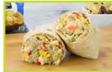
TERIYAKI HABANERO CHILE WRAP