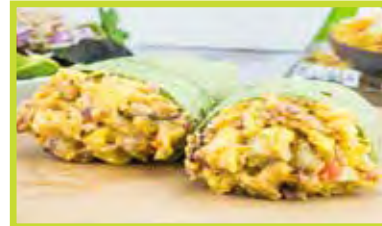
BACON EGG ROASTED POTATO, AND CHEDDAR CHEESE WITH SALSA WRAP