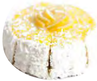
CALIFORNIA LEMON CAKE