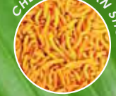
CHEDDAR CORN STICKS