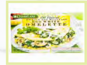
TURKEY BACON, VEGETABLE OMELETTE GLUTEN FREE