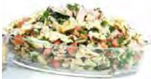
FARFALLE (BOW TIE) CHICKEN PASTA