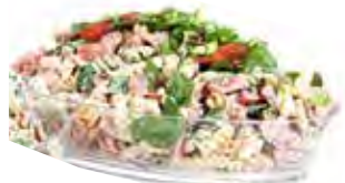
SPINACH PASTA SALAD