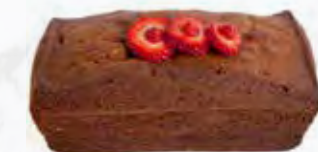
STRAWBERRY BREAD LOAF