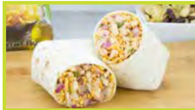
BBQ CHICKEN WRAP