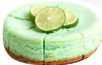
TROPICAL LIME CHEESECAKE