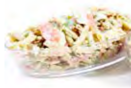
SEAFOOD PENNE SALAD WITH CILANTRO SAUCE