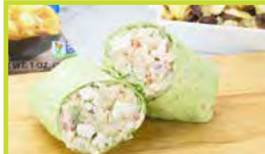
GRILLED CHICKEN WRAP