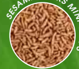
SESAME STICKS MINI CHIPS