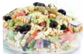
PASTA ITALIANO SALAD