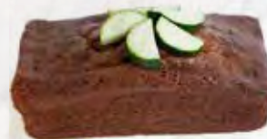
ZUCCHINI BREAD LOAF