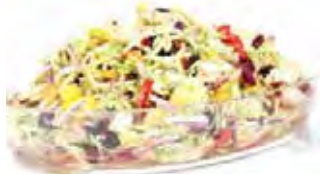
SPRING BROCCOLI CHICKEN SLAW SALAD