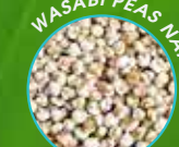
WASABI PEAS NATURAL