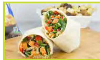
POWER SALAD WRAP