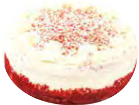
RED VELVET CAKE