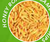
HONEY ROASTED SESAME MINI CHIPS