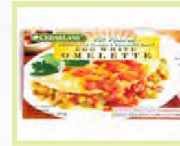
GREEN CHILE & RANCHERO SAUCE OMELETTE GLUTEN FREE