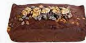
DATE NUT BREAD LOAF