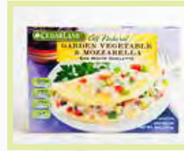
GARDEN VEGETABLE & MOZZARELLA OMELETTE GLUTEN FREE