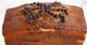
MARBLE BREAD LOAF