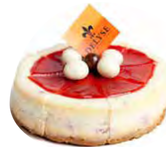
RASPBERRY GUAVA SWIRL CHEESECAKE