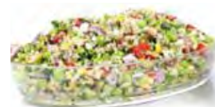
QUINOA & EDAMAME AND FETA CHEESE SALAD