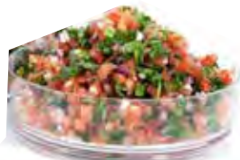
PICO DE GALLO SALAD