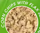
CORN CHIPS WITH FLAX SEEDS UNSALTED