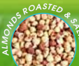
ALMONDS ROASTED & SALTED