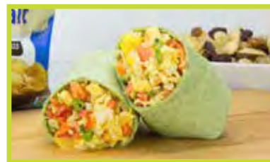
TERIYAKI PINEAPPLE CHICKEN WRAP