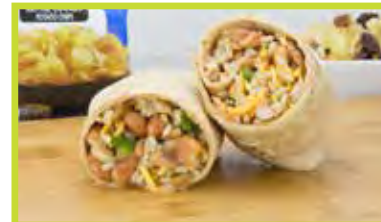
BEAN & RICE BURRITO WRAP