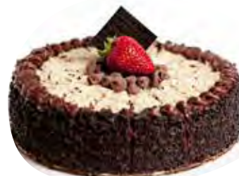
GERMAN CHOCOLATE CAKE WITH COCONUT