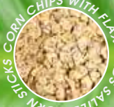
CORN STICKS CORN CHIPS WITH FLAX SEEDS - SALTED