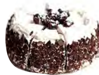
BLACK FOREST CAKE