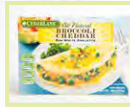
BROCCOLI CHEDDAR EGG WHITE OMELETTE GLUTEN FREE