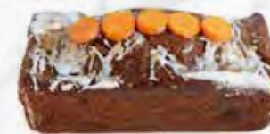
CARROT BREAD LOAF