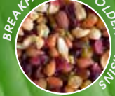
BREAKFAST MIX GOLDEN RAISINS